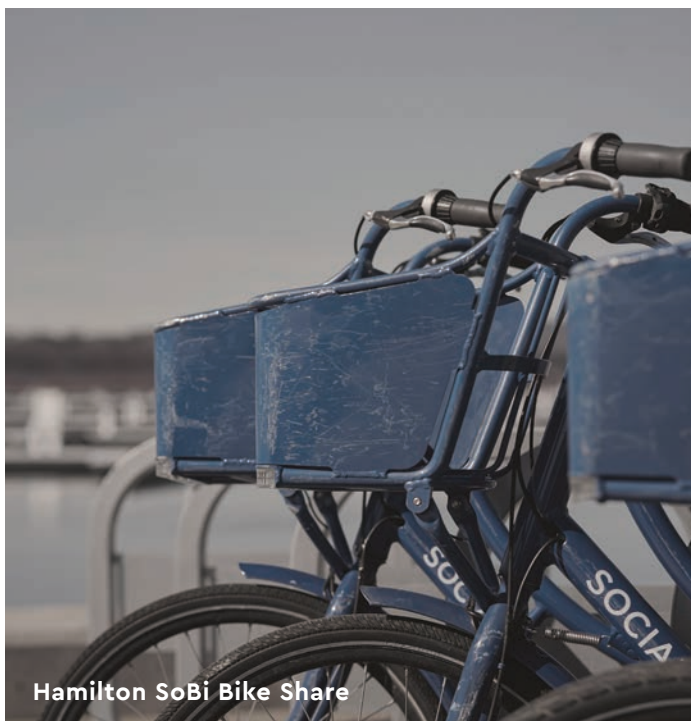
Hamilton SoBi Bike Share