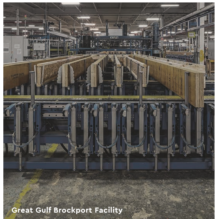
Great Gulf Brockport Facility