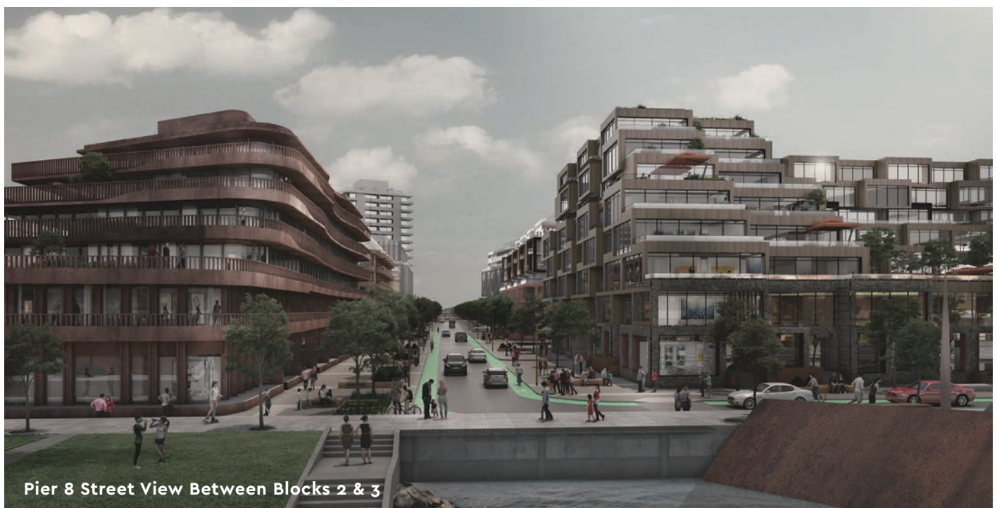
Pier 8 Street View Between Blocks 2 & 3