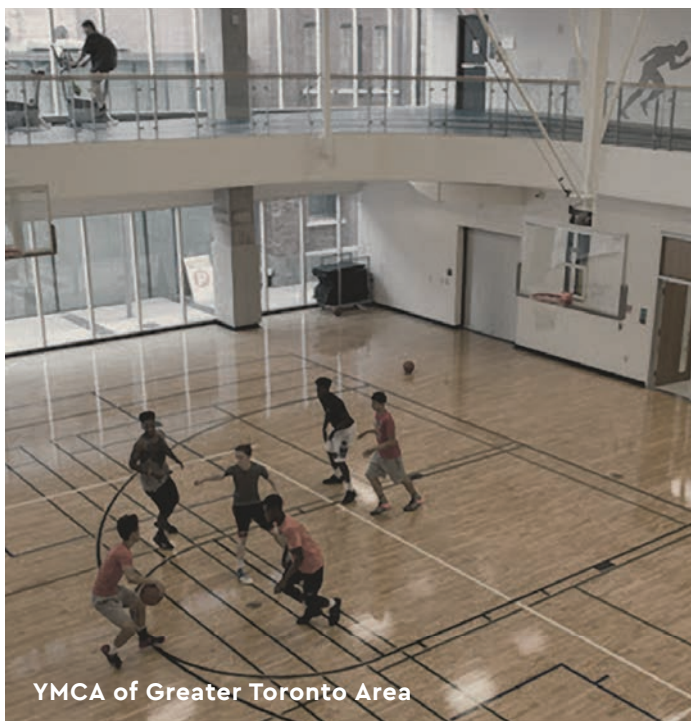
YMCA of Greater Toronto Area