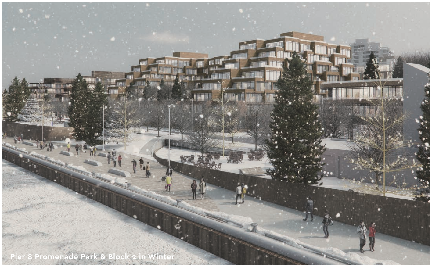
Pier 8 Promenade Park & Block 2 in Winter

It's important to Nora that the transformation of Pier 8 and the surrounding neighbourhood is inclusive to the diverse needs of the local community. It is very important to her that old residents of the North End and people with low socio-economic status are not pushed out of their homes. She would like to see public amenities such as a recreation centre, school, or daycare offered on site. For her own leisure, Nora would spend even more time down at the waterfront with the addition of new restaurants, cultural amenities such as galleries or theatres, and venues for special events.