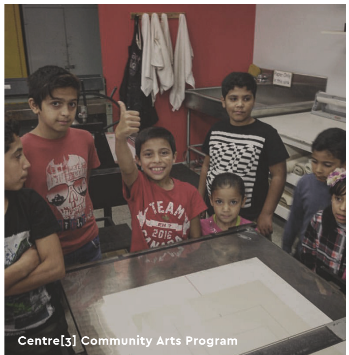
Centre[3] Community Arts Program