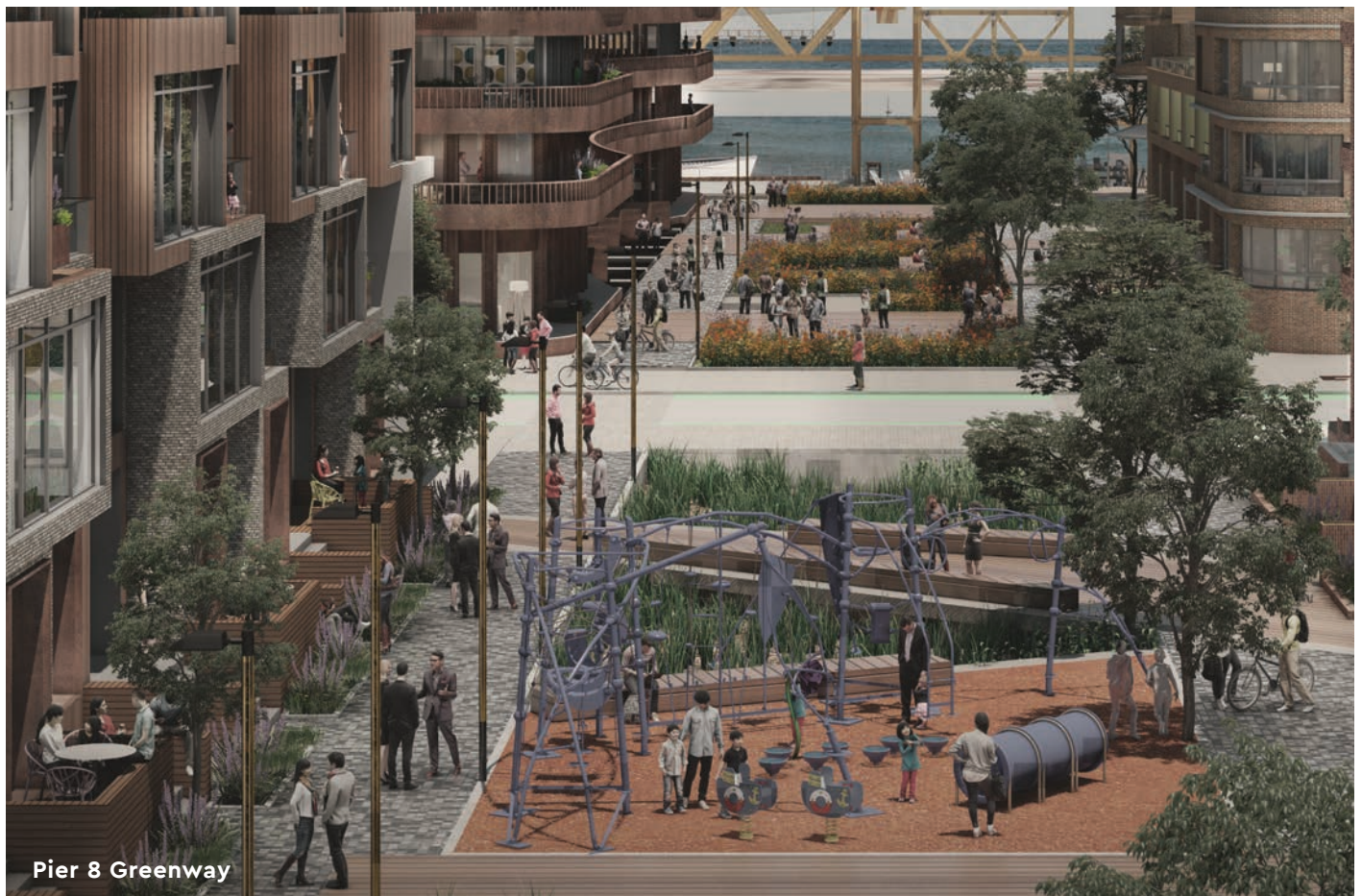
Pier 8 Greenway

The future Greenway and Promenade Park offer Emily and her family the perfect stomping grounds to exercise and explore in a safe outdoor environment while visiting the waterfront. A seating area to enjoy an ice cream cone on a summer day. Emily loves the idea that a waterfront visit offers activities for everyone. She plans to purchase a family membership pass at the new Art Gallery of Hamilton but is also happy to hear that she can spend some alone time with her husband checking out the latest art exhibit while her two children take a swimming lesson at the nearby community recreational centre.