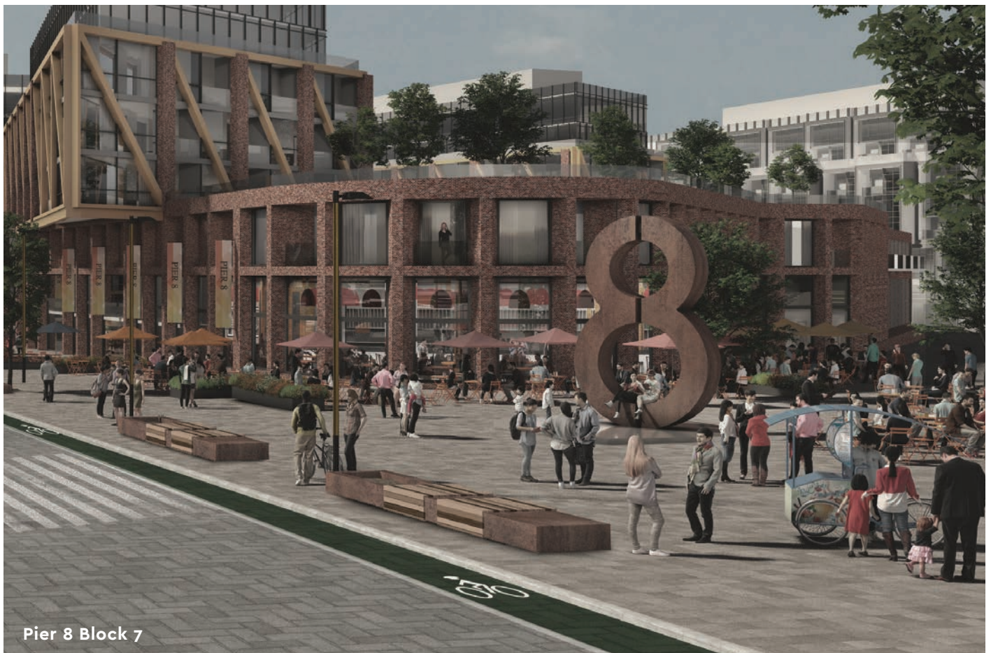
Pier 8 Block 7